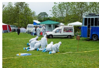
(From page one)

A lot of artists got inspired making books or an art piece in a suitcase for a traveling exhibition. It is nice to go and visit, because he can tell about the book making, and once you get there you can get lost in the boxes full with a monkey treasures, where you can find a lot of inspirations and lose the feeling about time.